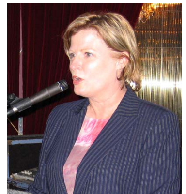
Federal Member Hon. Julie Owens

Hon Julie Owens condoled the death of the former President of India. Ms. Owens said the death was a great loss not only to India but also to the whole world. Mr Narayanan was a leader to reckon with and had risen to the highest position from a dalit family.