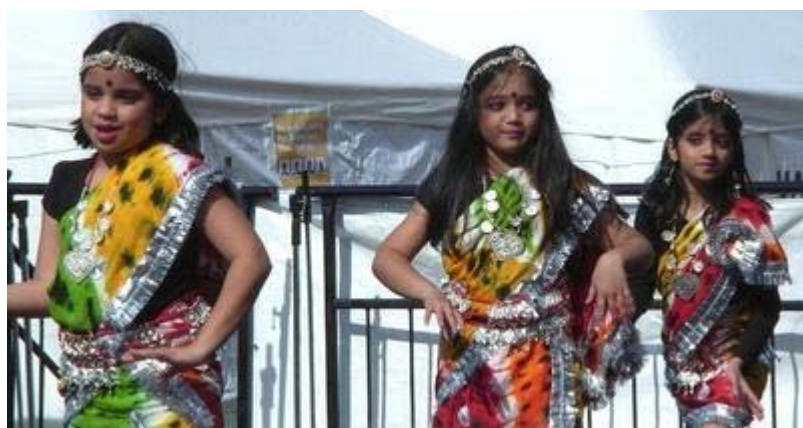
Dancers India Australia Friendship Fair 2009

August 15th is India's Independence Day and nowhere is it more royally celebrated in Australia than at the India Australia Friendship Fair in Sydney. This riot of colourful, music, dance and entertainment has got to be one of the best days out whether your background is from India or not and should be on your "what to do in Sydney" list if you are visiting Sydney in August.