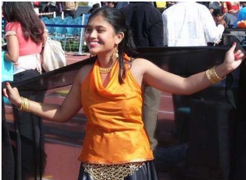
Dancer at India Australia Friendship Fair 2009

Podcast: Play in new window | Nkugp"Rt.gulf.gpv"O.tu'Ctwpc'Ej.cpf.tcr:"Tcf.kq"Kpvgtxkgy